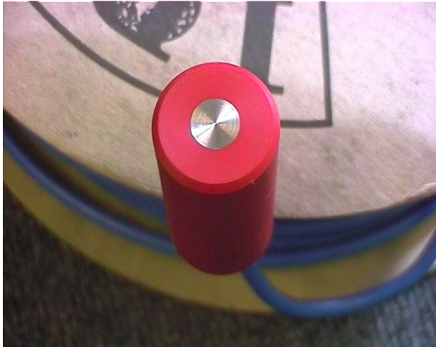
1cm 2 AC Coupon

Test/monitoring coupons are increasingly becoming an essential tool in the monitoring of cathodic protected buried pipelines. Coupons provide a convenient and efficient means of measuring important parameters such as the coupon to soil AC discharge current density or the coupon to soil instant-OFF potential.